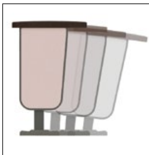
Uprights can be mounted on sloped floors from 0 to 10 degrees