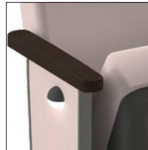
An aisle light can be added to end panels for a better wayfinding.