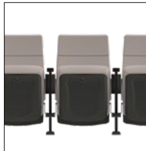
5 widths (19"-23" / 482 - 584mm) and 1 height (35" / 890mm). Our Freedom models feature no arms in center, only on end of aisle rows.