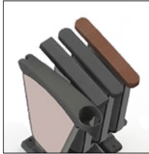
Different options for the armcap, according to your needs.