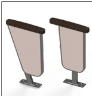
Two different shapes (T - Z) for the end row panel.