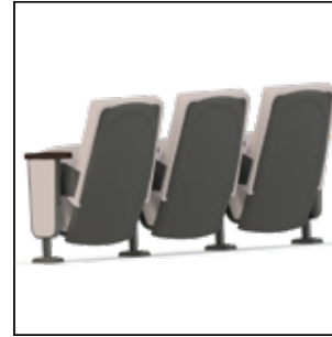
Plastic injected back and seat cover.