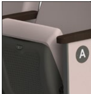
Row markers in the end panels and numbering by seat.