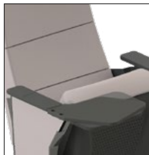
A tablet arm (two sizes available) provides an useful surface to write and can be stored out of the way.