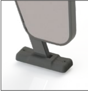
Plastic cover protects the anchor plate assembly and improves aesthetics.