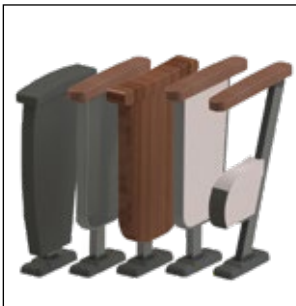
A wide range of options (wooden, upholstered or, laminated) for end panels helps to grow up the set aesthetics.