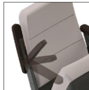
ADA access guaranteed thanks to a flip-up arm