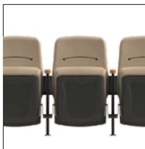
5 widths (19"-23" / 482-584mm) and 2 heights (35" and 38" / 890 and 965mm). Our Freedom model feature no arms in center, only on end of aisle rows.