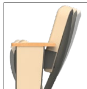
The backrest suits three-pitch positions at 15°, 18°, 21°. Seat suits at 90° for Space saving envelope, and 75° for standard position.