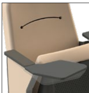
A tablet arm (two sizes available) provides an useful surface to write and can be stored out of the way.