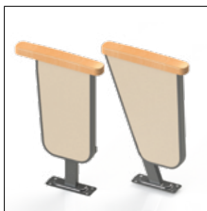
Two different shapes (T - Z) for the end row panel.