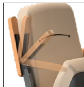
ADA access guaranteed thanks to a flip-up arm