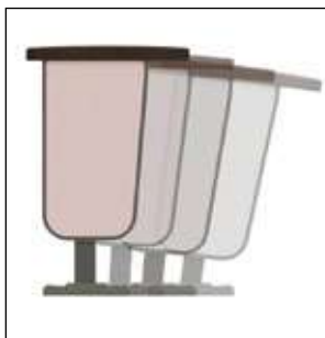
Uprights can be mounted on sloped floors from 0 to 10 degrees