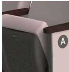
Row markers in the end panels and numbering by seat.