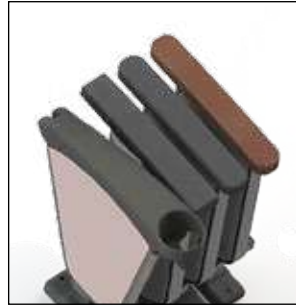
Different options for the armcap, according to your needs.