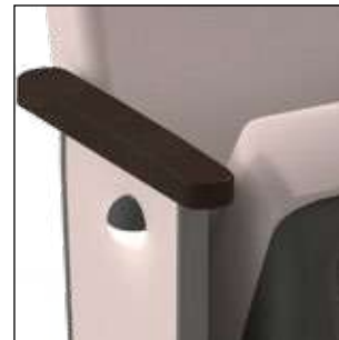
An aisle light can be added to end panels for a better wayfinding.