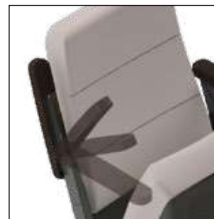
ADA access guaranteed thanks to a flip-up arm