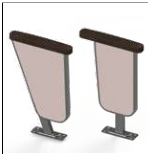
Two different shapes (T - Z) for the end row panel.