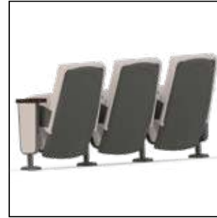
Plastic injected back and seat cover.