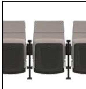
5 widths (19"-23" / 482 - 584mm) and 1 height (35" / 890mm). Our Freedom models feature no arms in center, only on end of aisle rows.