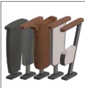
A wide range of options (wooden, upholstered or, laminated) for end panels helps to grow up the set aesthetics.