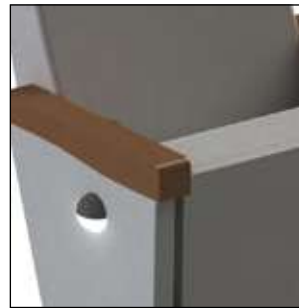
An aisle light can be added to end panels for a better wayfinding.