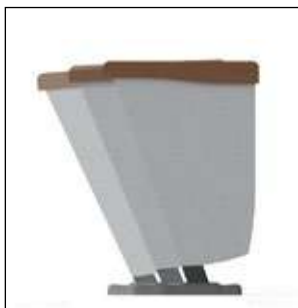
Uprights can be mounted on sloped floors from 0 to 5 degrees