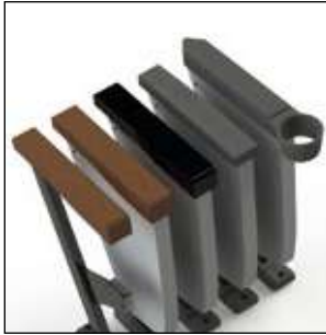
Different options for the armcap, according to your needs.