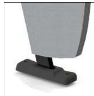
Plastic cover protects the anchor plate assembly and improves aesthetics.