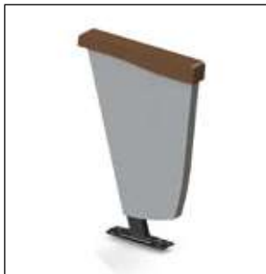
Z shape for the end row panel.