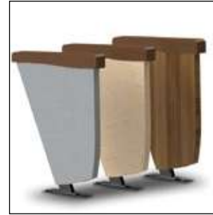
A wide range of options (upholstered, thermolaminated, laminated) for end panels helps to grow up the set aesthetics.