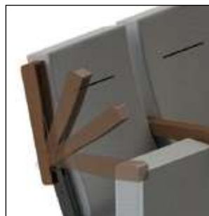
ADA access guaranteed thanks to a flip-up arm