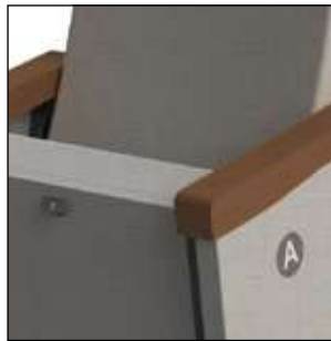
Row markers in the end panels and numbering by seat.