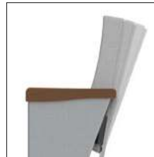
The backrest suits three-pitch positions at 15°, 18°, 21°. Seat suits at 90°