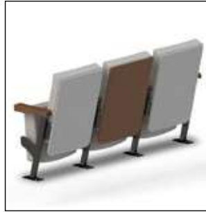
Upholstered, thermolaminated and laminated back and seat cover.